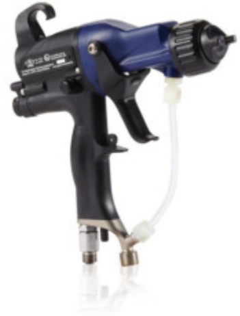
Pro Xp Air Spray Gun Model