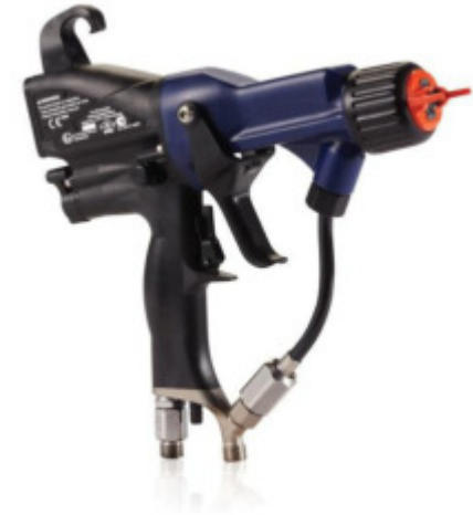
Pro Xp Air Assist Gun Model